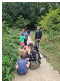
Looking for Touch-me-Nots