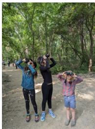
Scanning for birds

Two guides lead each outing: experienced birders who also excel at environmental education. To erase as many barriers to access as possible, we offer all outings for free, most convenient to city bus lines, and provide quality binoculars.