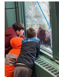
Vulture Encounter The Raptor Center

See us on the trail and we don't look like your typical group quietly ambling down the path, stopping to scan the trees and bushes. We scatter along the path and just as often stop to look at holes, poop, plants (we love Touch-me-Nots AKA Jewelweed), nests, feathers, rocks, insects, toads and turtles.