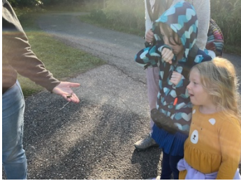
Meeting a Grasshopper in the field

MYBirdClub offers more than birding. Our young birders attended naturalist-led programs, crafted their own birds and feathered dinosaurs, and discovered how many M&Ms and Oreos they'd have to eat if they ate like a chickadee in winter (pounds worth).